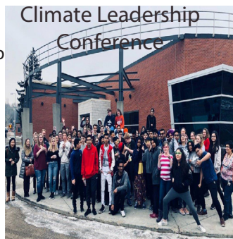
Climate Leadership Conference