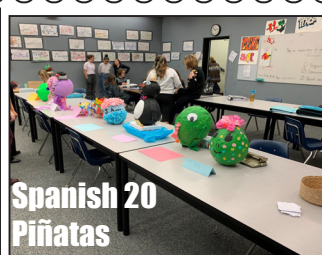
Spanish 20 Piñatas