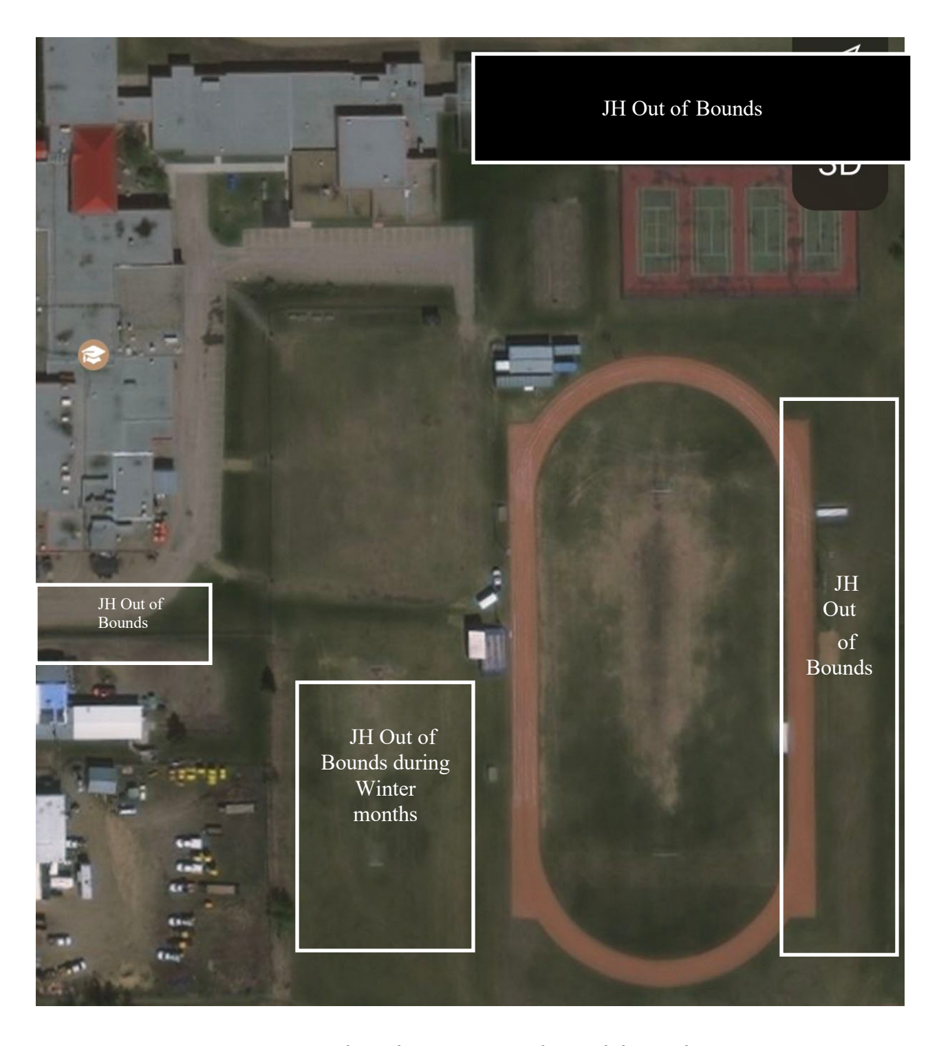
Junior High students cannot go beyond the track

Store, Service Station and Front of school are <u>ALWAYS</u> Out of Bounds for Jr/High Student.